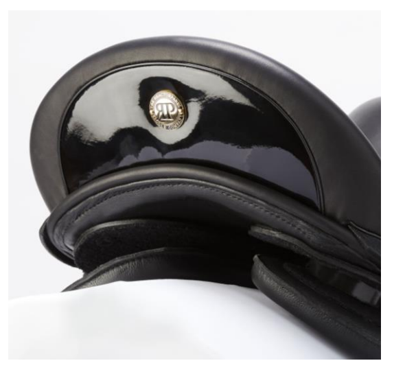
Black Patent Insert.