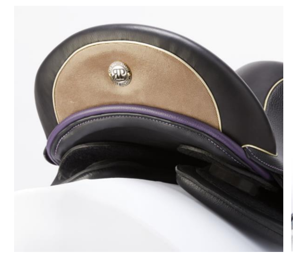
Camel Insert, Purple Facing.