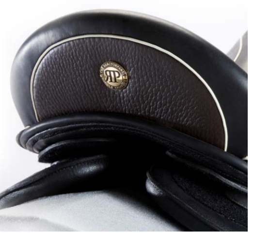
Dark Brown Patterned Insert.