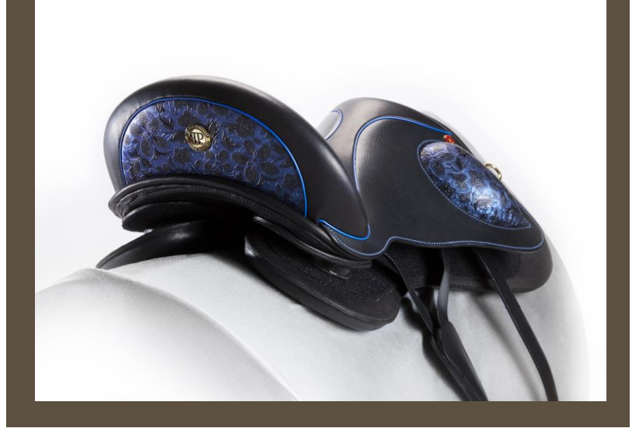
Create a one-of-a-kind look with stitching.

Outline the skirt of the saddle – or order a pair of stitched flaps, to match!