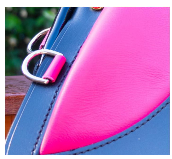
Small Details Make a Big Difference...