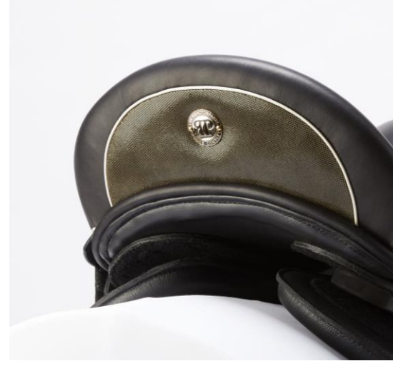
Olive Green Insert.