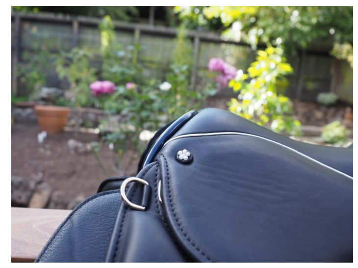
Oh....and Seed Pearl Head Nails